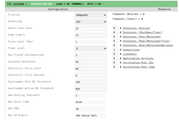
Figure 2: N2IWF operational GUI